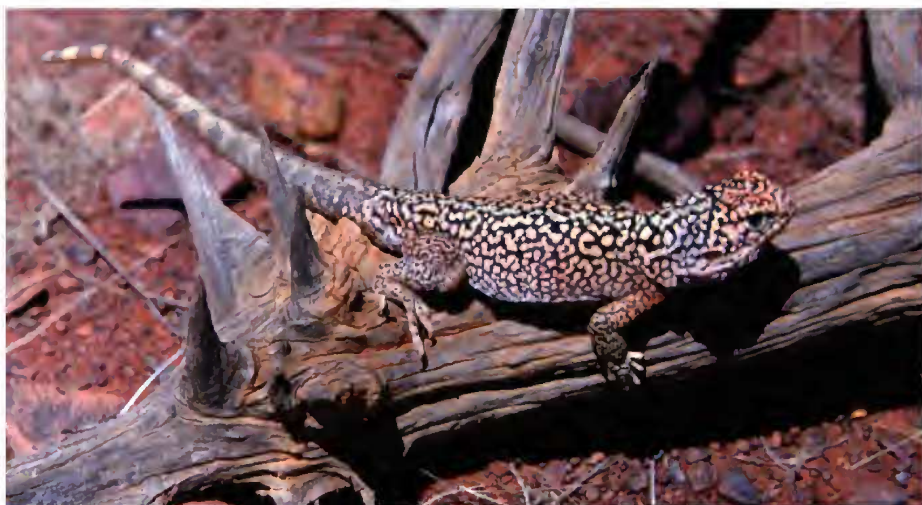
Figure 1. Male Ctenophorus reticulatus on dead mulga (near Meekatharra).